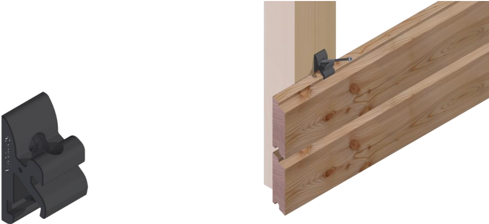
Figure A.1. Principle of the fixing system