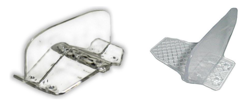
Figure 1. Examples of individual, small scale snow stoppers.

Relevant manufacturer's stipulations having influence on the performance of the product covered by this European Assessment Document shall be considered for the determination of the performance and detailed in the ETA.